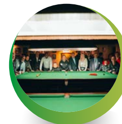
Romford Snooker Club