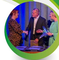
Presenting to Jungle Hair & Beauty at the Havering Small Business Awards